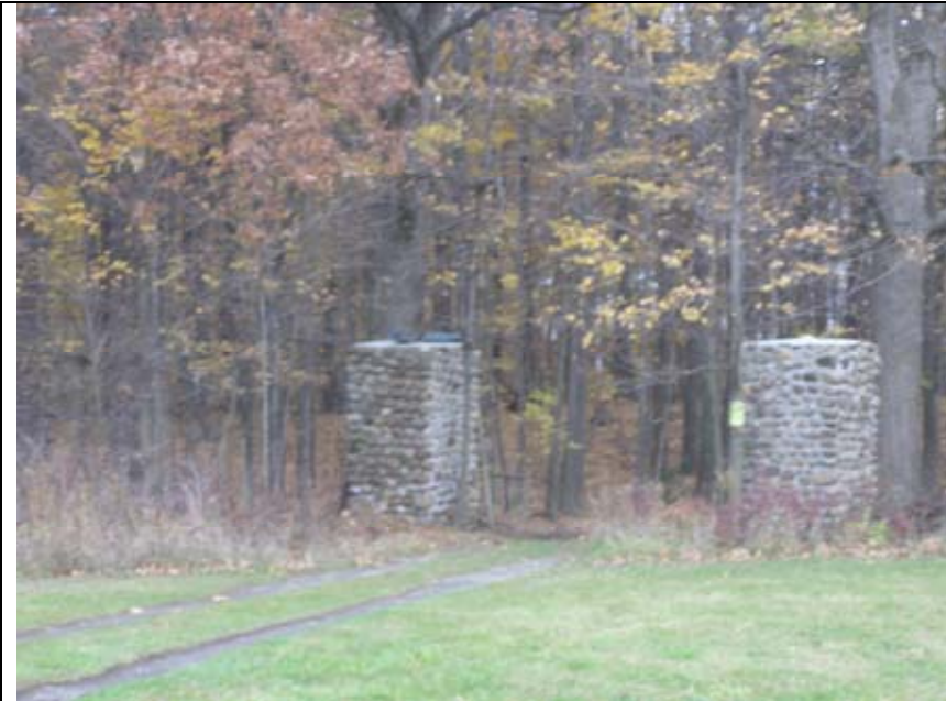
315B: Masonry piers at about 3823 Houk Rd.