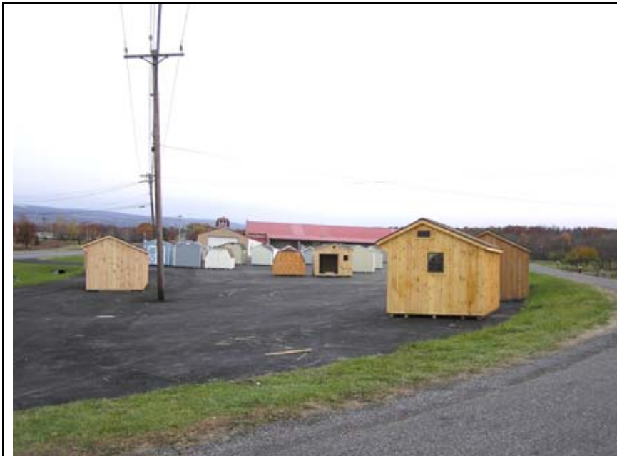
342B: Business at 3700 State Rt 14