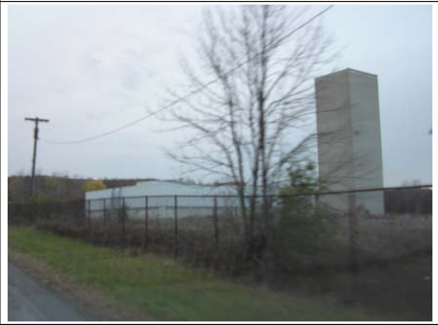
351C: Buildings at former Morton Salt, Severne Rd.