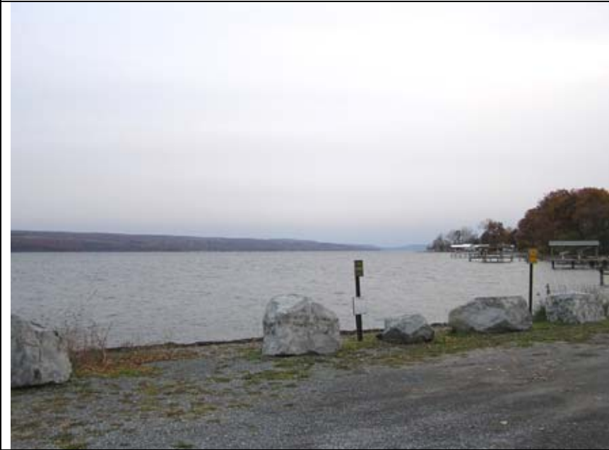
347E: View South from NYSDEC boat launch, Severne Rd.