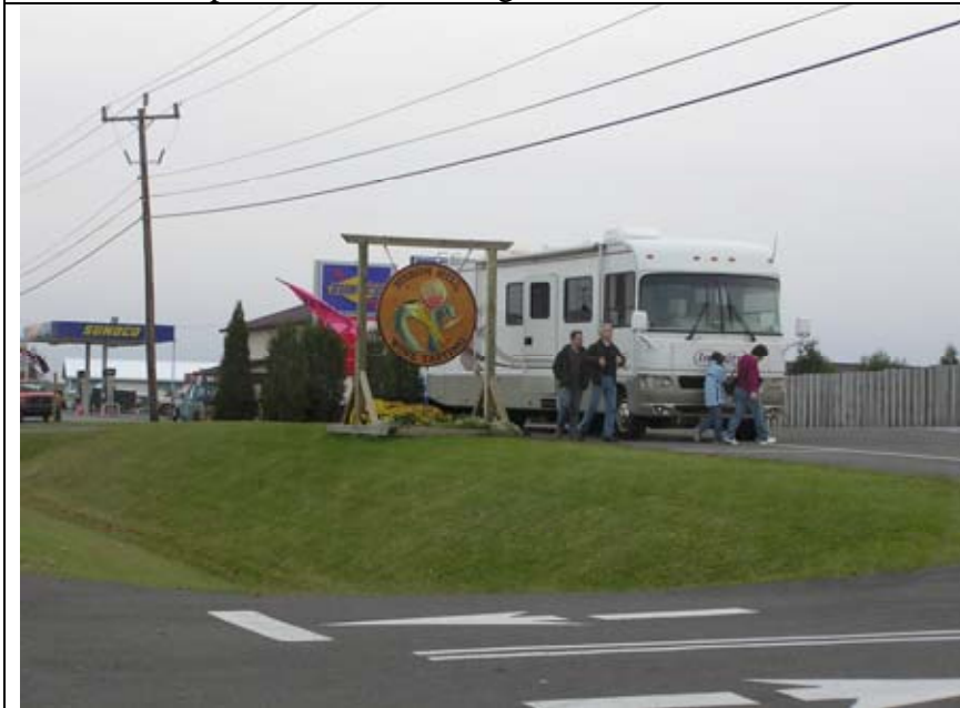
333B: Heron Hill Winery signage at 3586 State Rt 14.