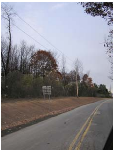
324A: No erosion control, South side at 3548 Himrod Rd.