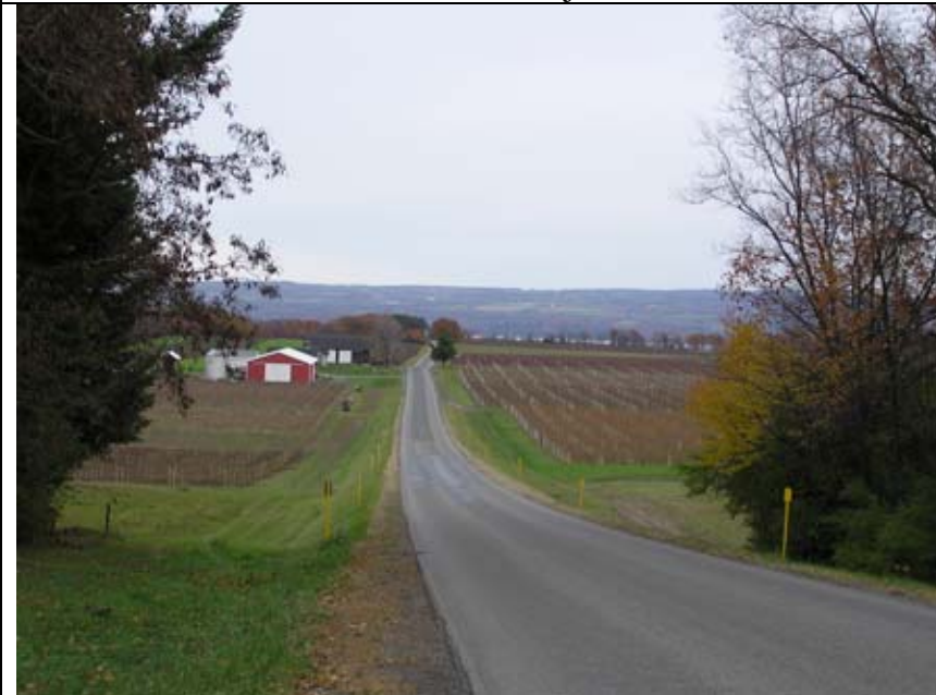
314C: View East down Rice Hill Rd. 1/4 mile east of Lewis Rd.