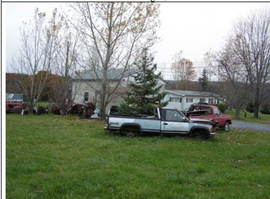
344B: Property maintenance at 371 Severne Rd.