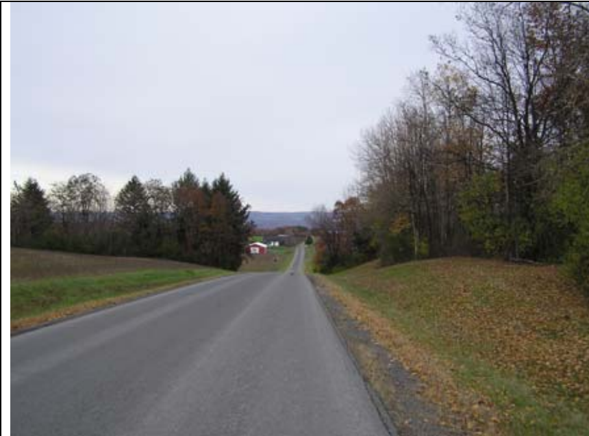
314A: View East down Rice Hill Rd. just East of Lewis Rd. int.