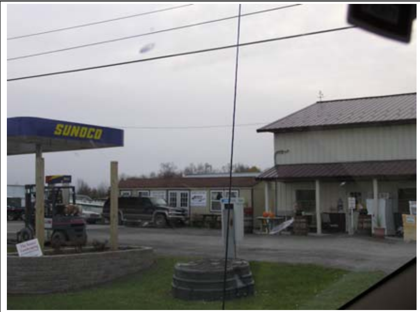
334C: Main building at 3612 State Rt 14