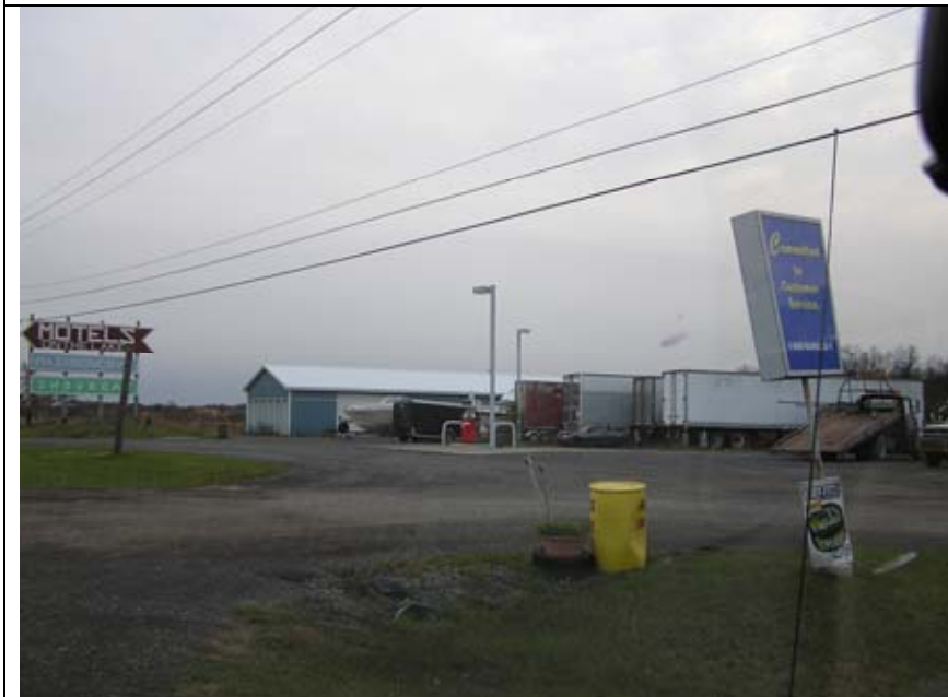
334D: Truck trailer parking/storage area, 3612 State Rt 14