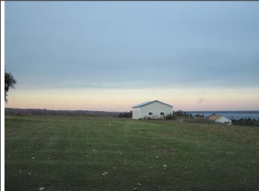
348A: View North by NE from about 310 Severne Rd.