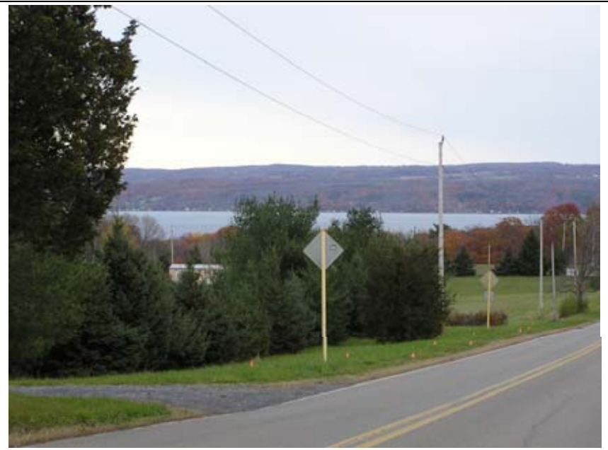
326: View ENE from Plum Point Rd., 1,500 ft. E of Rt 14 int.