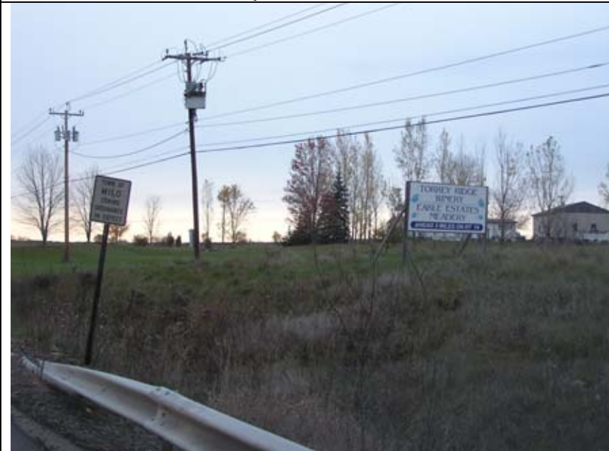
349: Off premises bus. sign, East side Rt 14 at Town boundary