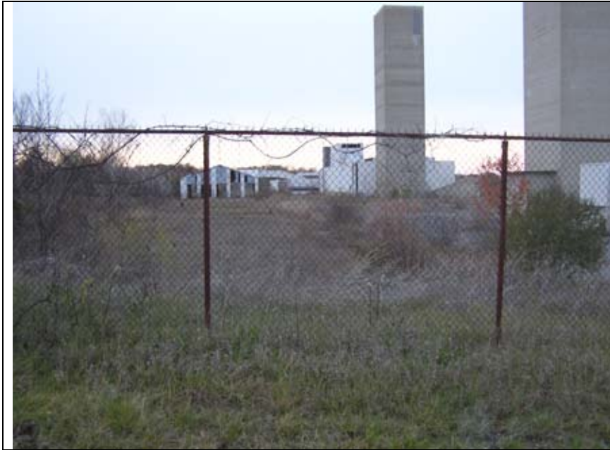
351D: Buildings at former Morton Salt, Severne Rd.