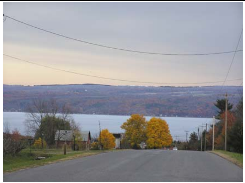
336: View East from about 420 Hall Rd.