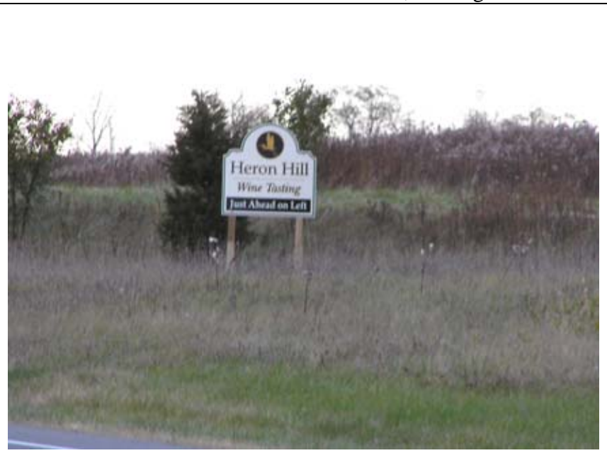
343A: Off premises bus. sign, E of Rt 14, 200' S of Severne Rd