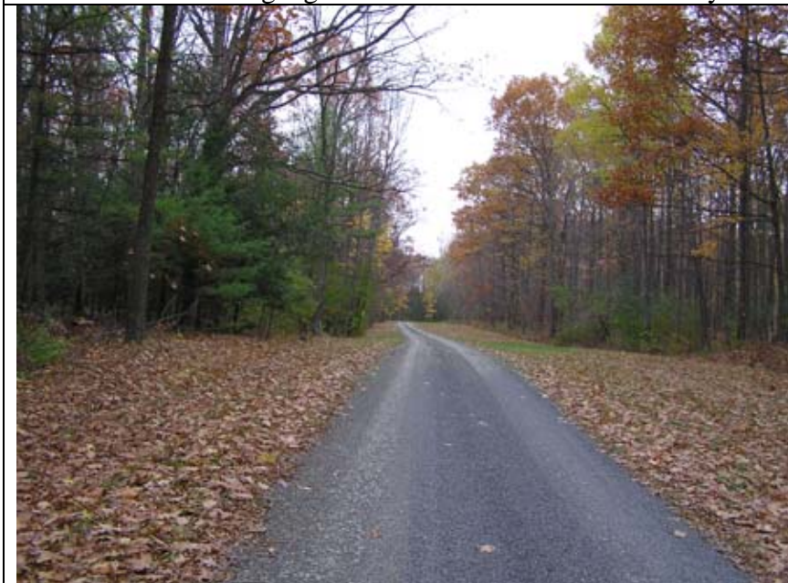
312: View South down Lewis Rd. just south of Rice Hill int.