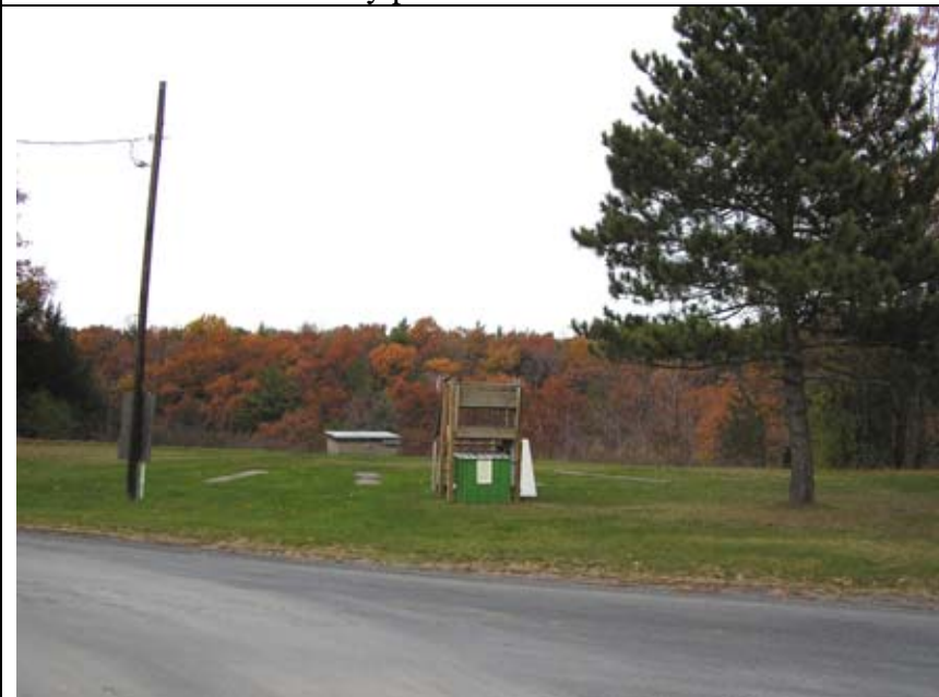
317A: Himrod Conservation Club at about 800 Rice Hill Rd.