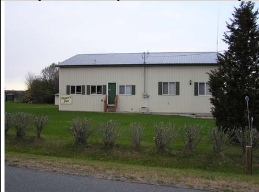
337: Business? at 430 Hall Rd.