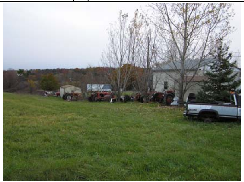
344C: Property maintenance at 371 Severne Rd.