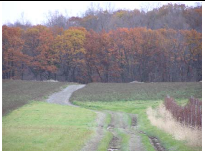
319B: Close up of Morehouse's gravel pit