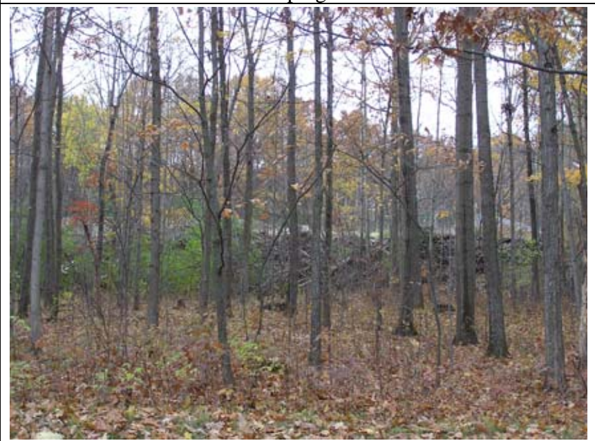
313A: View east toward former land fill from Lewis Rd.