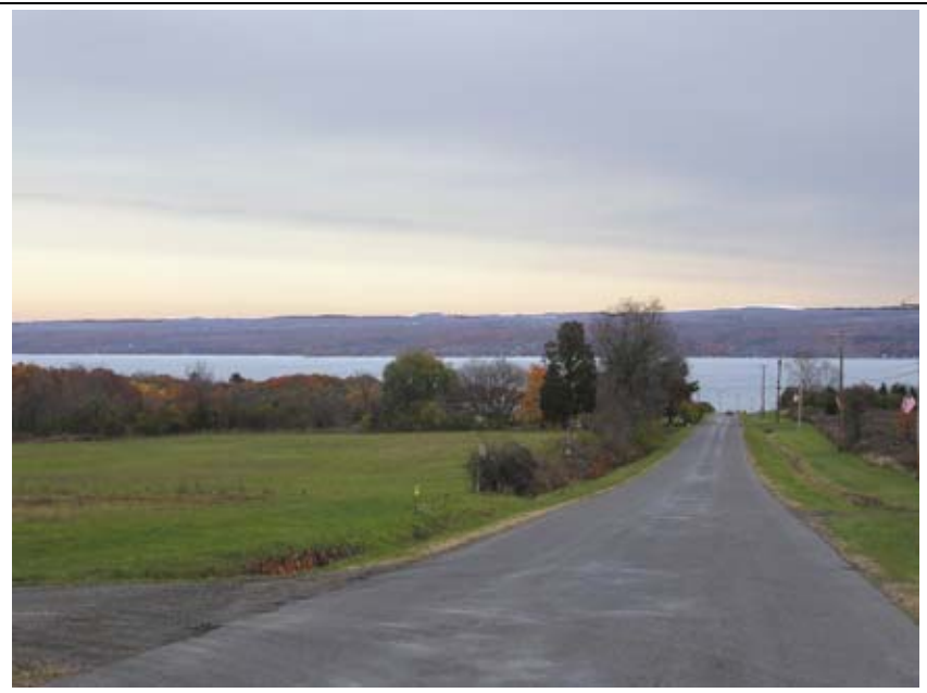
338: View East from about 354 Hall Rd.