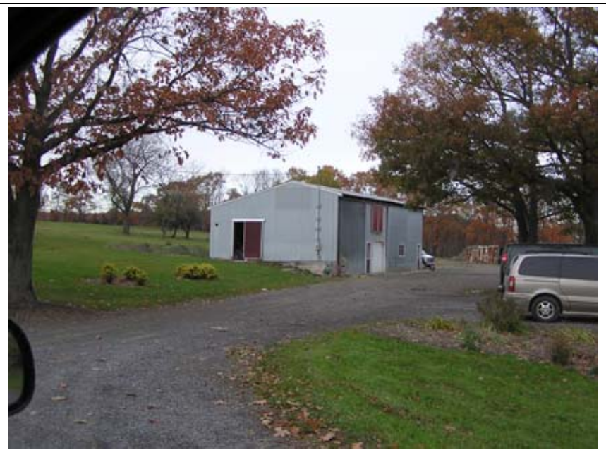
318: Fabrication business at 920 Rice Hill Rd.