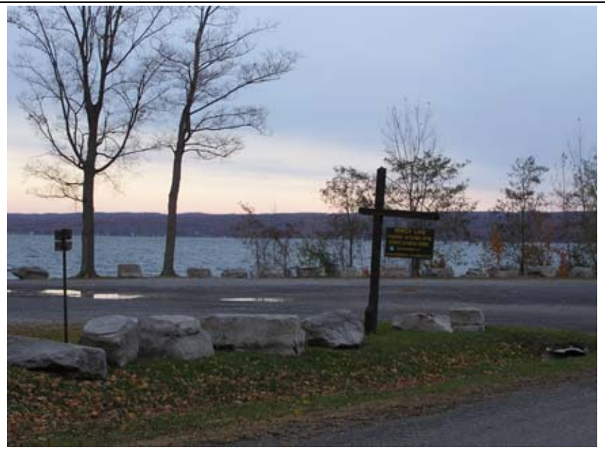
347B: View E by NE from NYSDEC boat launch, Severne Rd.