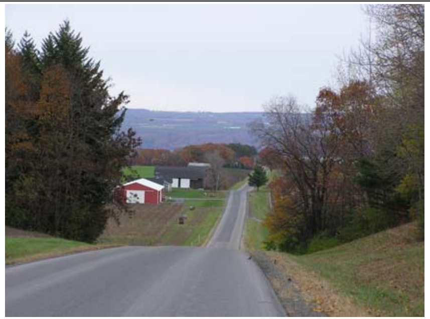
314B: View East down Rice Hill Rd, 1/8 mile east of Lewis Rd.