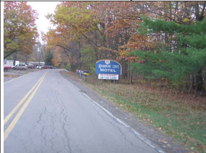
327: Off premises business sign at 243 Plum Point Rd.