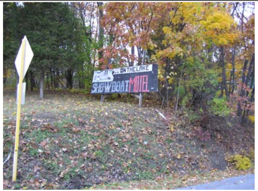
340: Off premises business sign at about 3514 S. Plum Pt Rd.