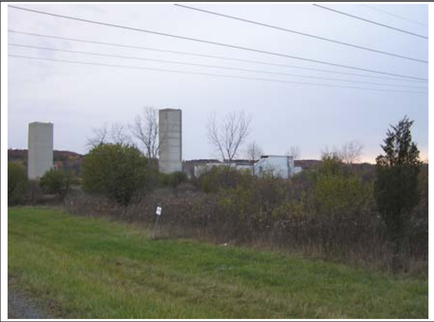
352: View south at RR crossing on Severne Rd.