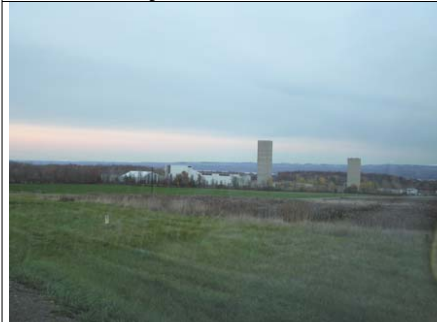
353: View North East from about 3817 Himrod-Lakemont Rd.