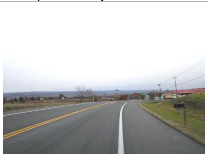
342A: View South toward business at 3700 State Rt 14