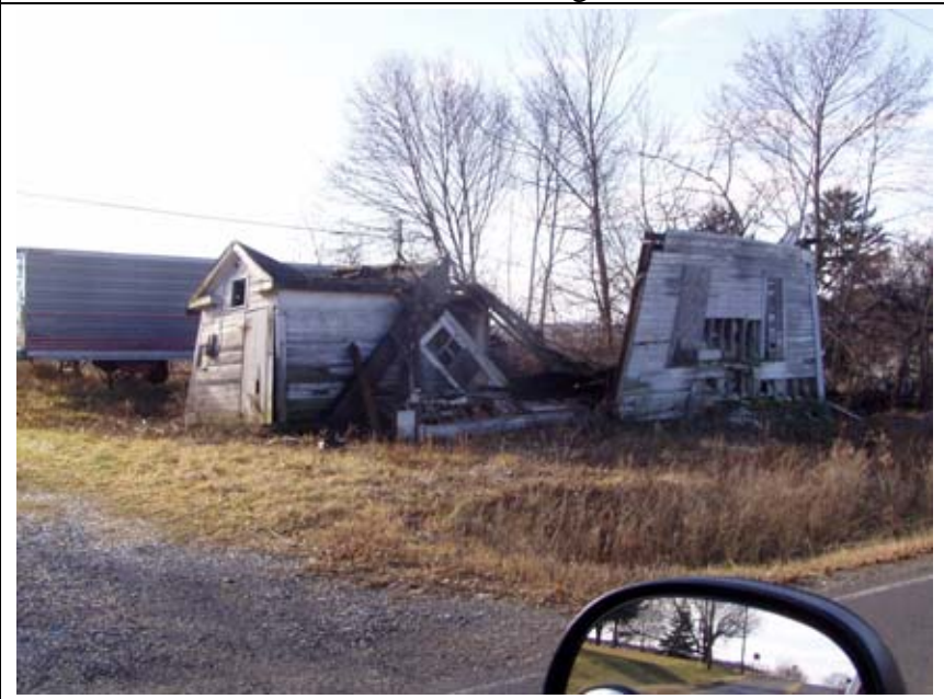
355: Property maintenance, approx 2363 Second Milo Rd.