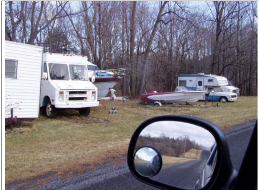
355: Outdoor Storage, North Side Sisson Rd. across from 2283