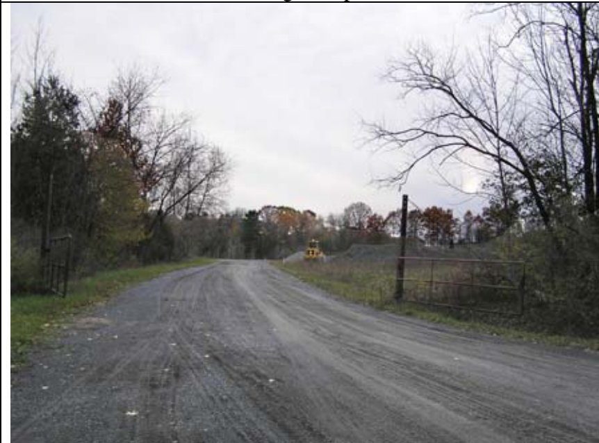
320: View into Town of Milo gravel pit, South side Rice Hill Rd.