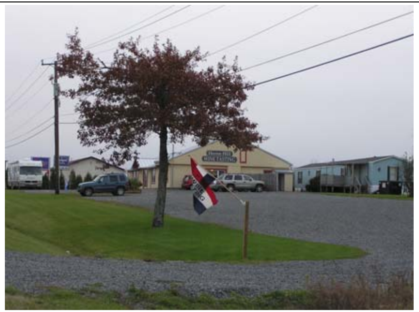
333A: Heron Hill Winery at 3586 State Rt 14