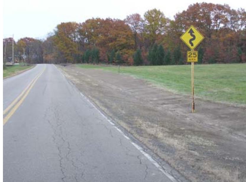
324B: Looking South toward 3548 Himrod Rd. area--erosion