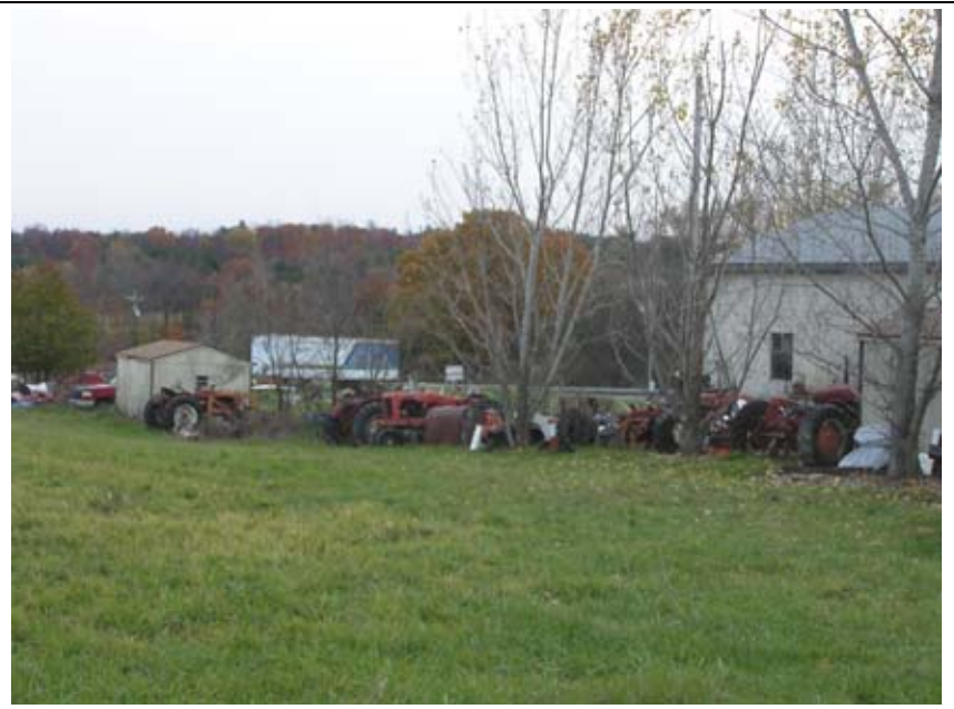
344A: Property maintenance at 371 Severne Rd.