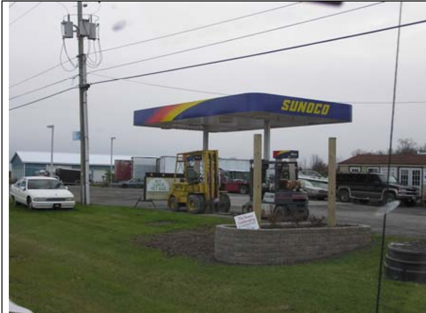
334B: Gas station island at 3612 State Rt 14