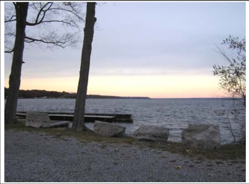
347F: View North from NYSDEC boat launch, Severne Rd.