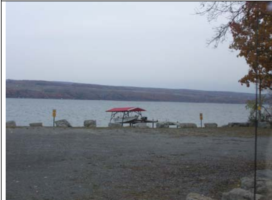
347A. View SW from NYS DEC boat launch site, Severne Rd.