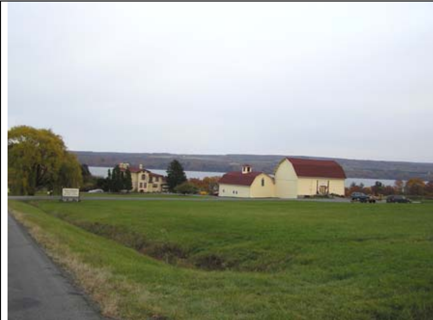
339: 4 Chimneys Winery at 211 Hall Rd.