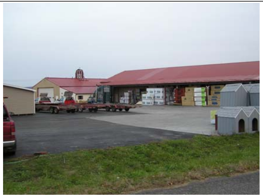
342C: Business at 3700 State Rt 14, looking East