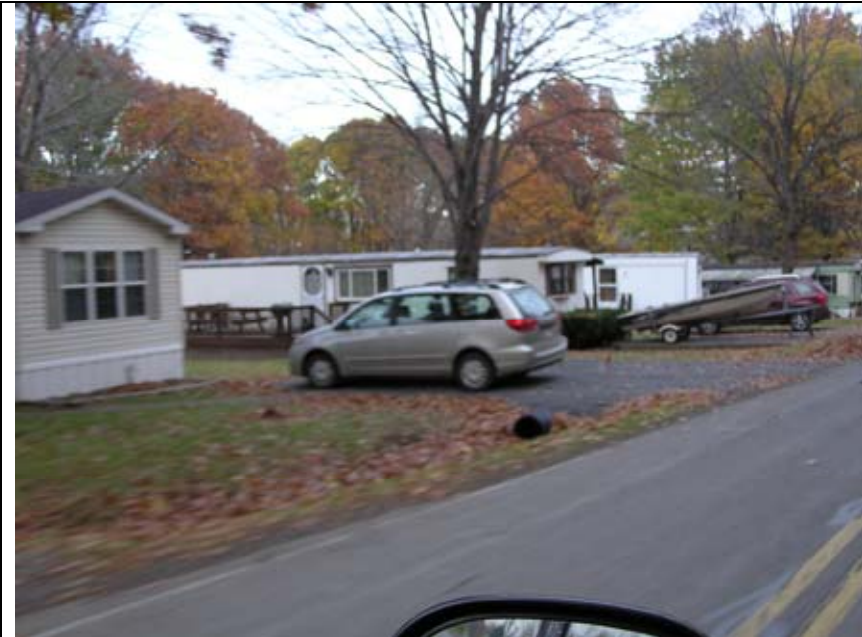
328B: Long Bow Mobile Home Park, 240 Plum Point Rd.