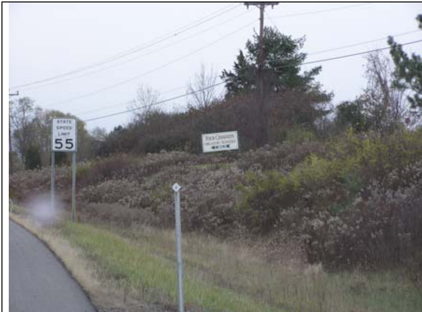
332: Off premises business sign at about 3671 State Rt 14.