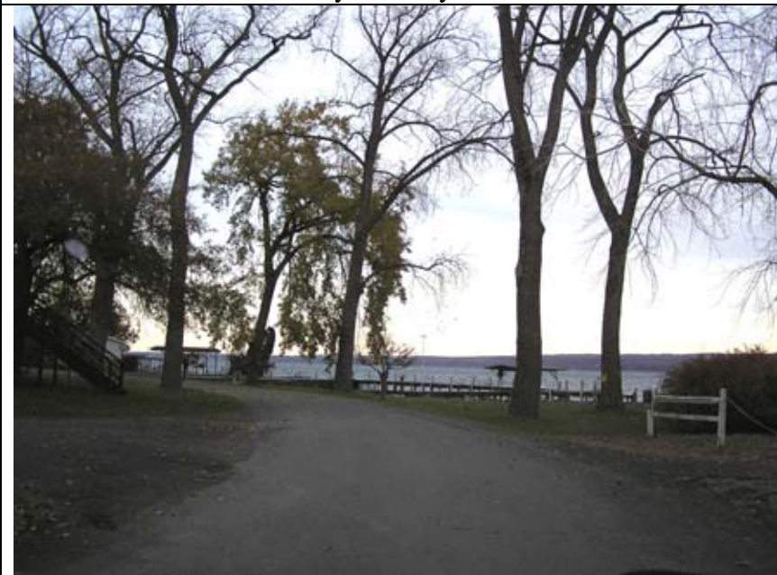
341: View NE from about 3499 South Plum Point Rd.