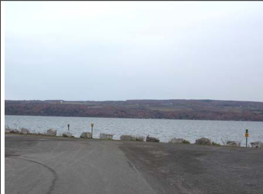
347C: View East from NYS boat launch, Severne Rd.