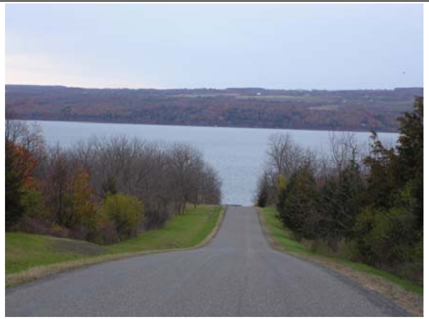
346: View East from 2/3 distance down hill from Rt 14