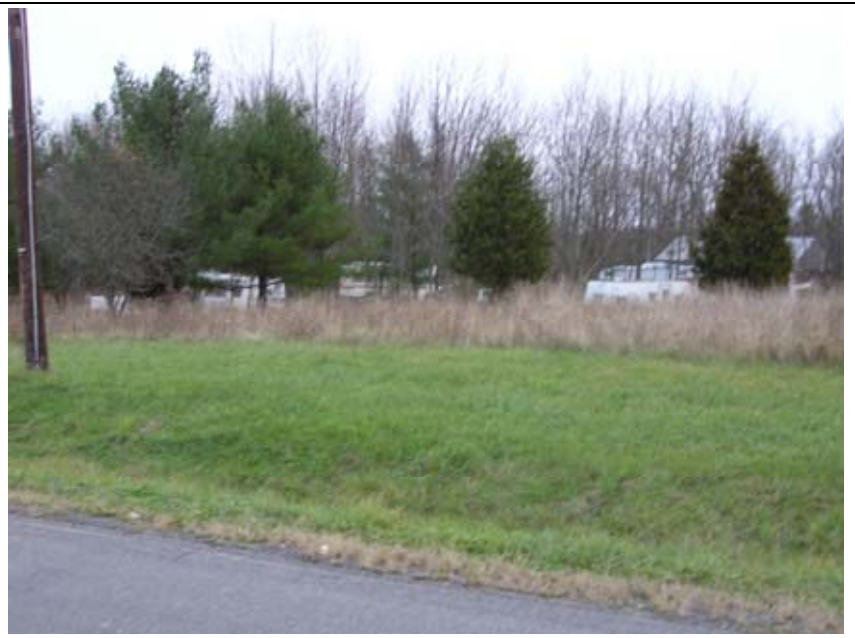
350A: Private RV campground, at 445 Severne Rd.