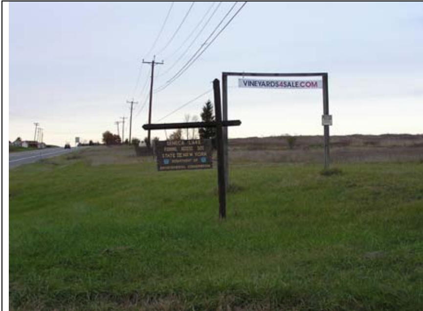
343B: Recreation & business signs, NE 14 & Severne Rd