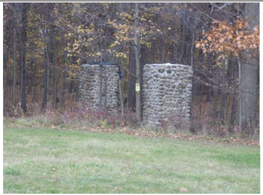
315A: Masonry piers at about 3823 Houk Rd.