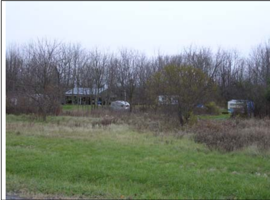
350B: Private RV campground at 445 Severne Rd.