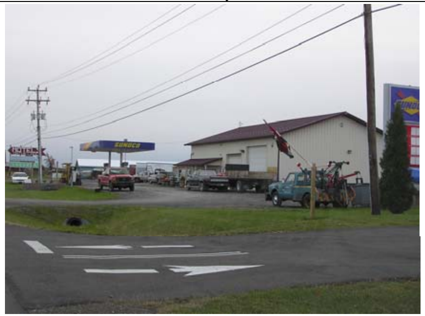
334A: Gas station at 3612 State Rt 14.