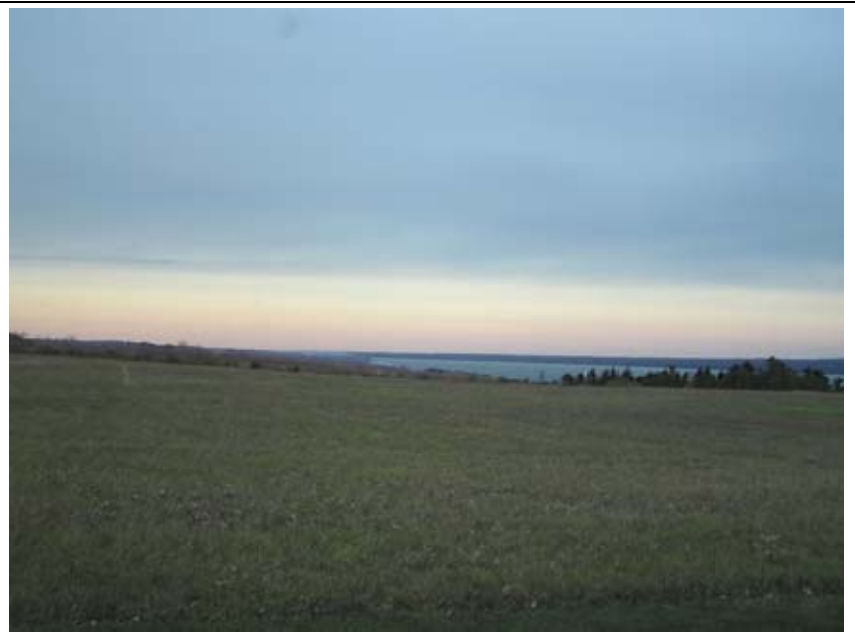
348B: View North East from about 310 Severne Rd.