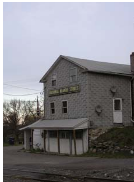
323: Post Office, Store at 3619 Himrod-Lakemont Rd.