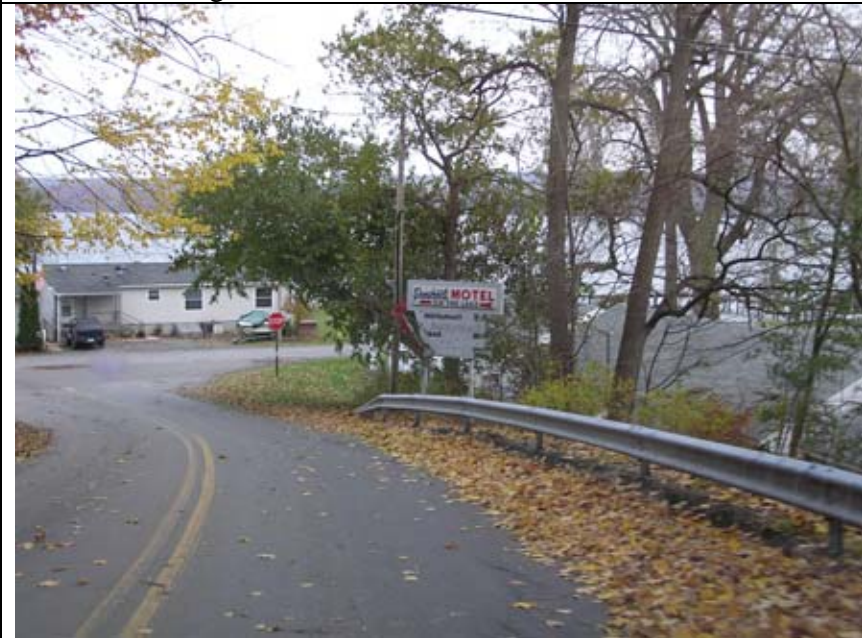
330: Business sign just east of corner Plum Point & N. Plum Pt.