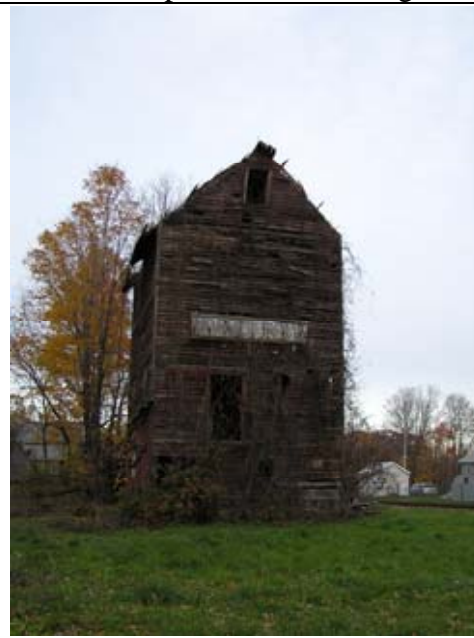
321: Grain Elevator on RR, 732 South St. Himrod