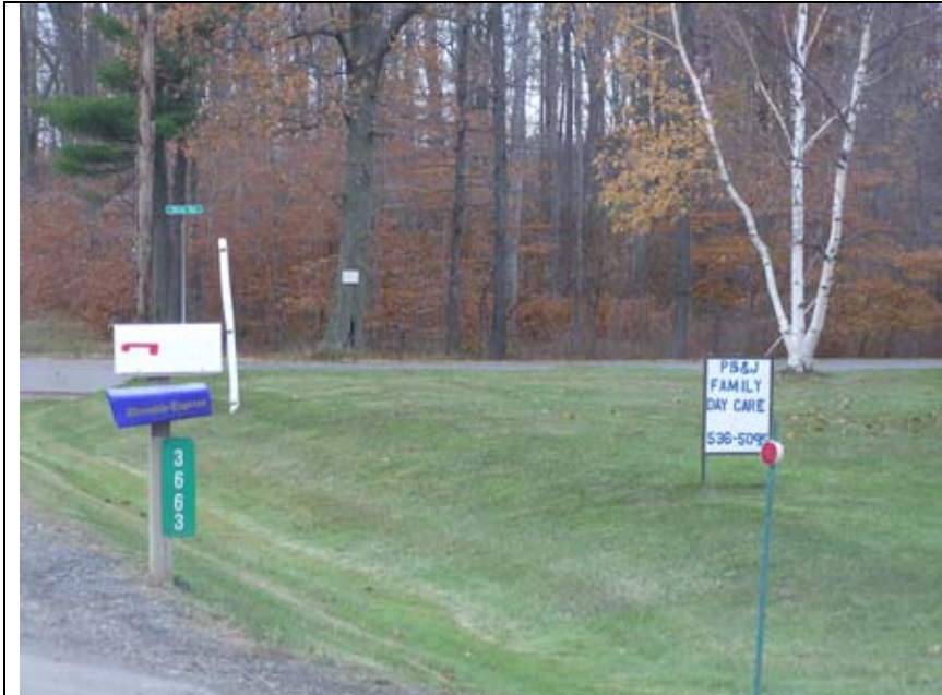
310B: Business signage at 3663 Chubb Hollow Rd.--Daycare