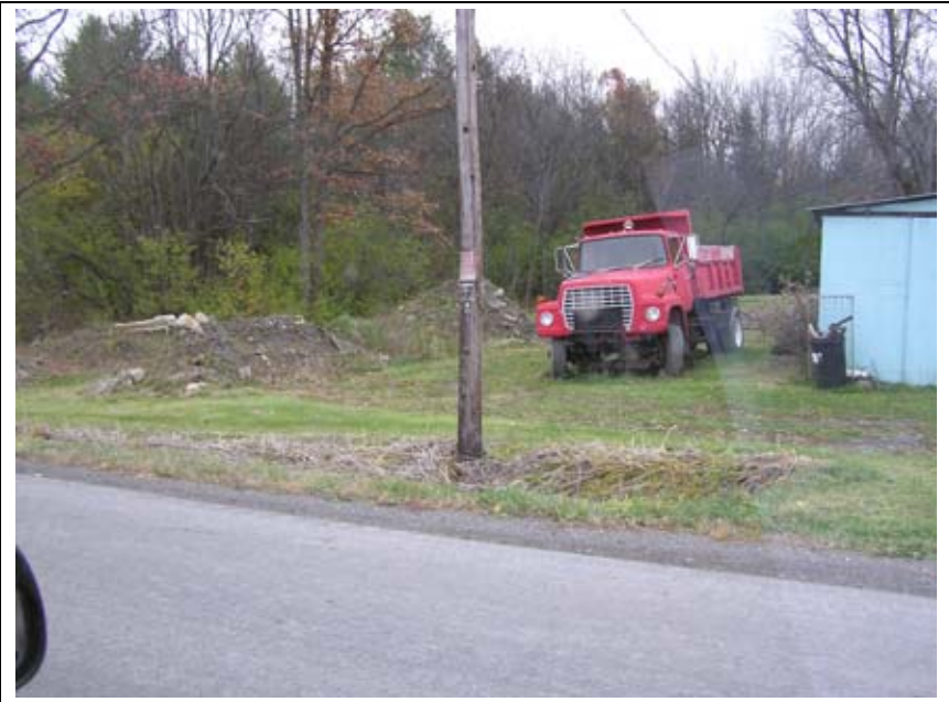
311: Business and dumping at 1309 Rice Hill Rd.