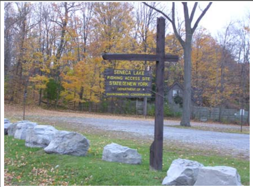
347D: Signage at NYSDEC boat launch, Severne Rd.