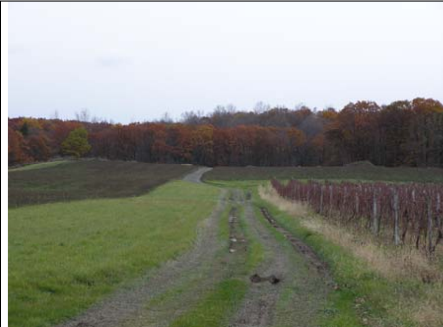
319A: View into Morehouse's gravel pit, South side Rice Hill Rd.