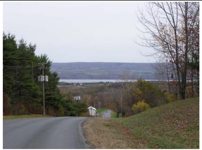
316: View East from about 896 Rice Hill Rd.