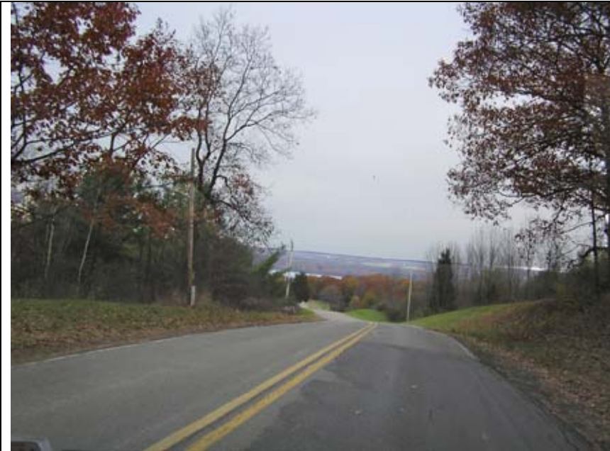
325: View SE from Plum Point Rd. (just east of Rt 14 int.)