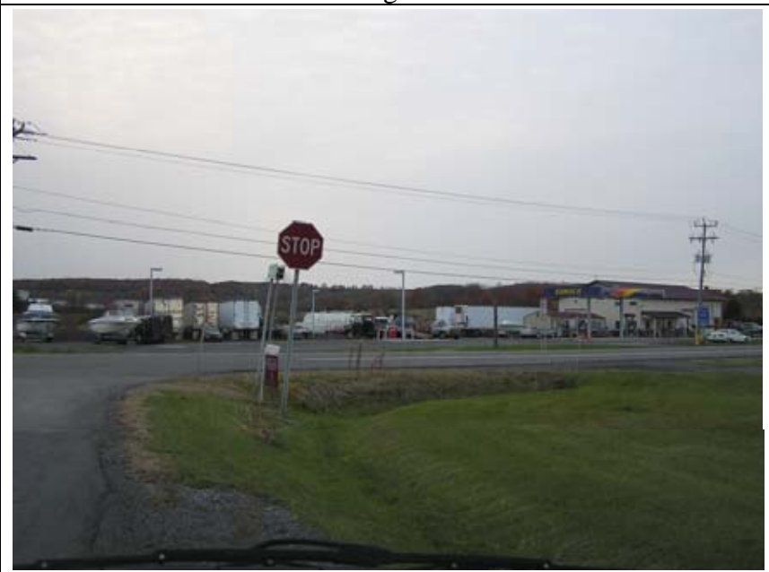
334E: View west toward 3612 State Rt 14