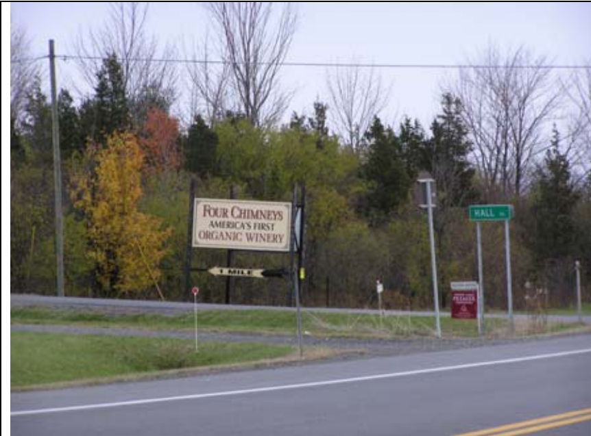
335: Off premises business signs at NE corner of Rt 14 & Rapalee