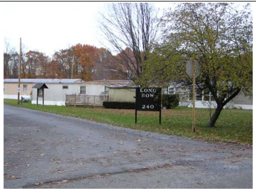
328A: Long Bow Mobile Home Park, 240 Plum Point Rd.