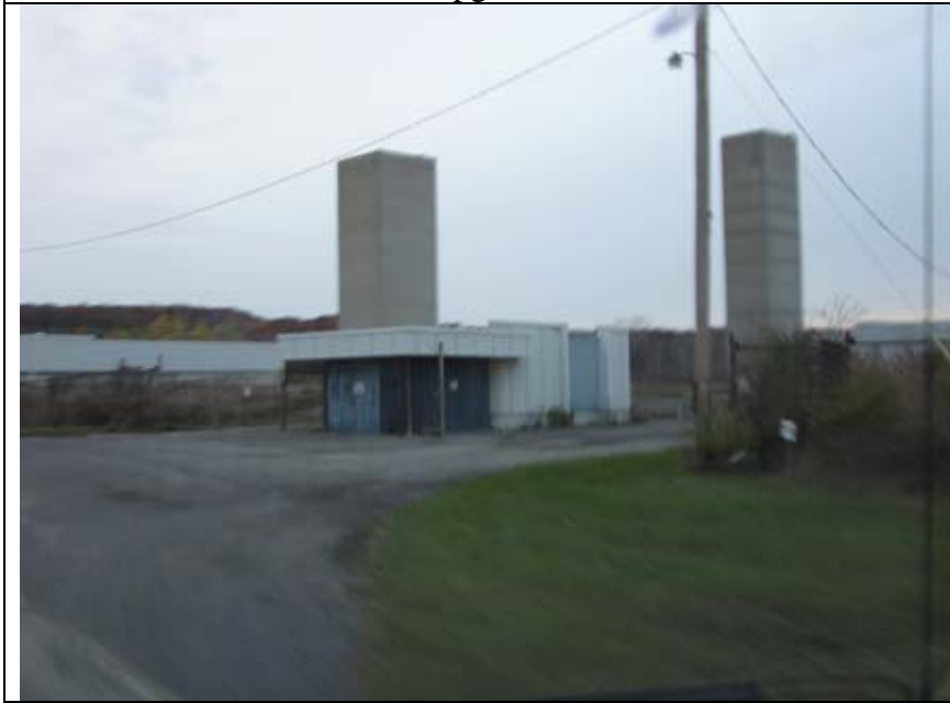
351B: Entry buildings at former Morton Salt, Severne Rd.