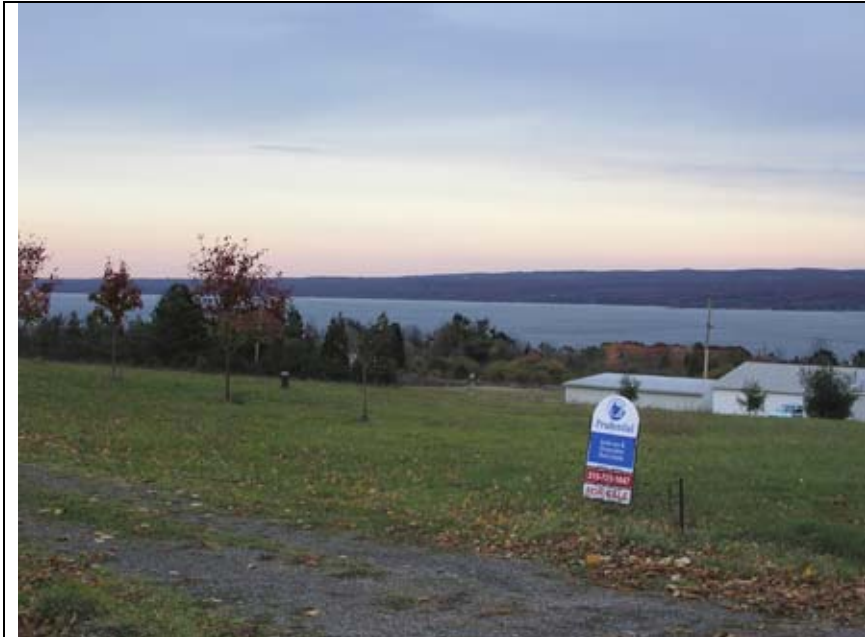
345: View NE from about 340 Severne Rd.