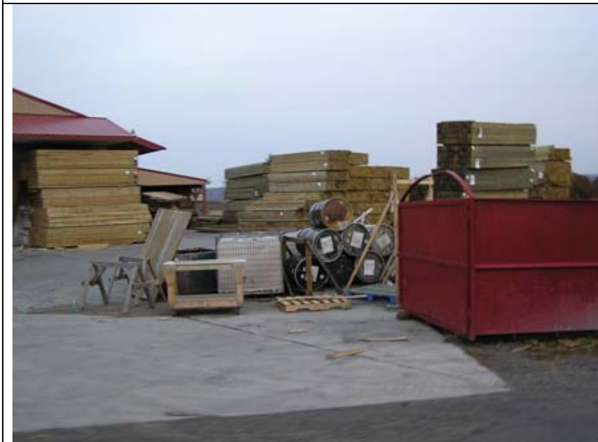
342D: Outdoor storage at 3700 State Rt 14