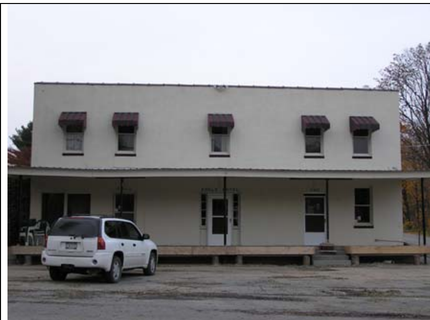
322: Eagle Hotel, SW corner Himrod-Lakemont Rd. & Rice Hill